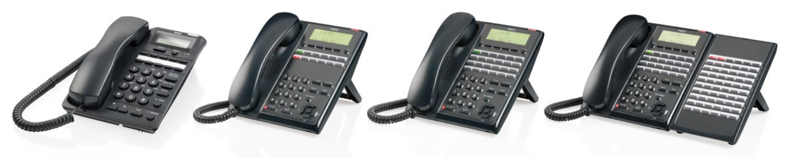
Digital and Analogue Handsets: Easy call control from the office