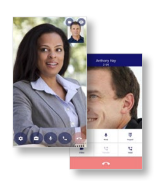
Smartphone Client: ST500