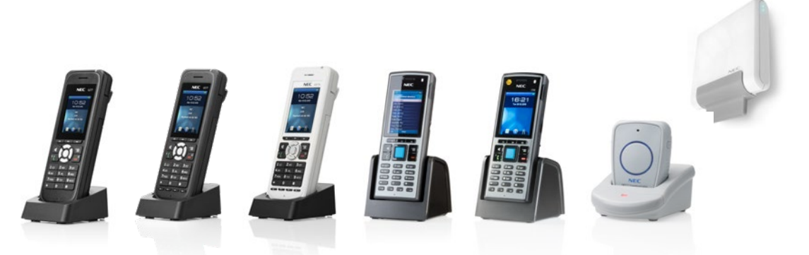
DECT: Cordless freedom for any working environment