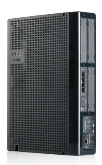
SL2100 Communication Server: