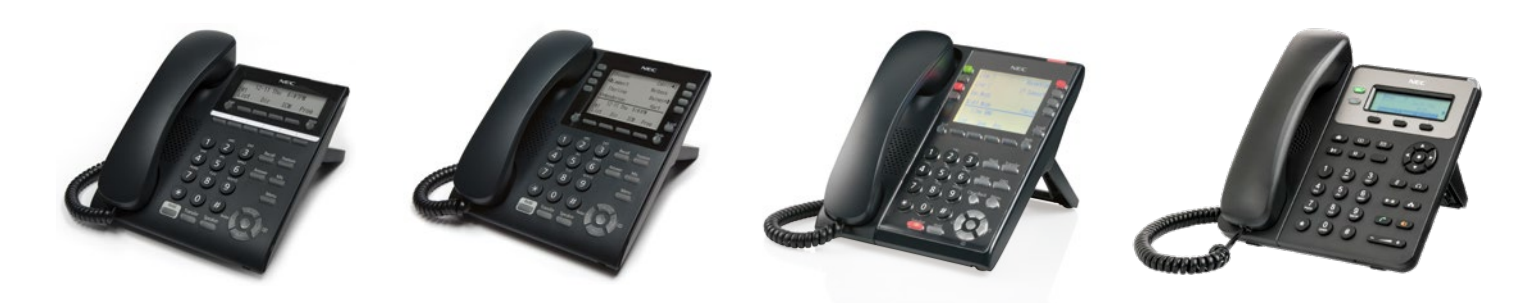
IP Handsets: Easy call control from the office, remote office or homeworking, hot-desking